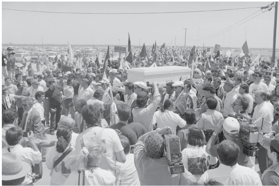
People walk with the coffin of Cesar Chavez.