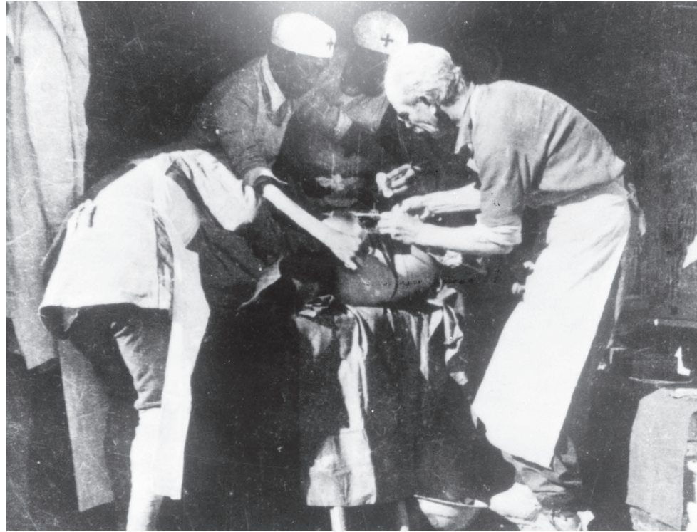
Dr. Norman Bethune saves a life.